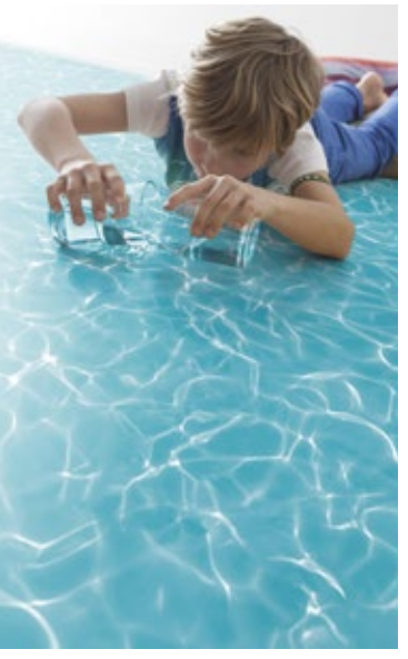
All our customizable floors available on myfloorbygerflor.com