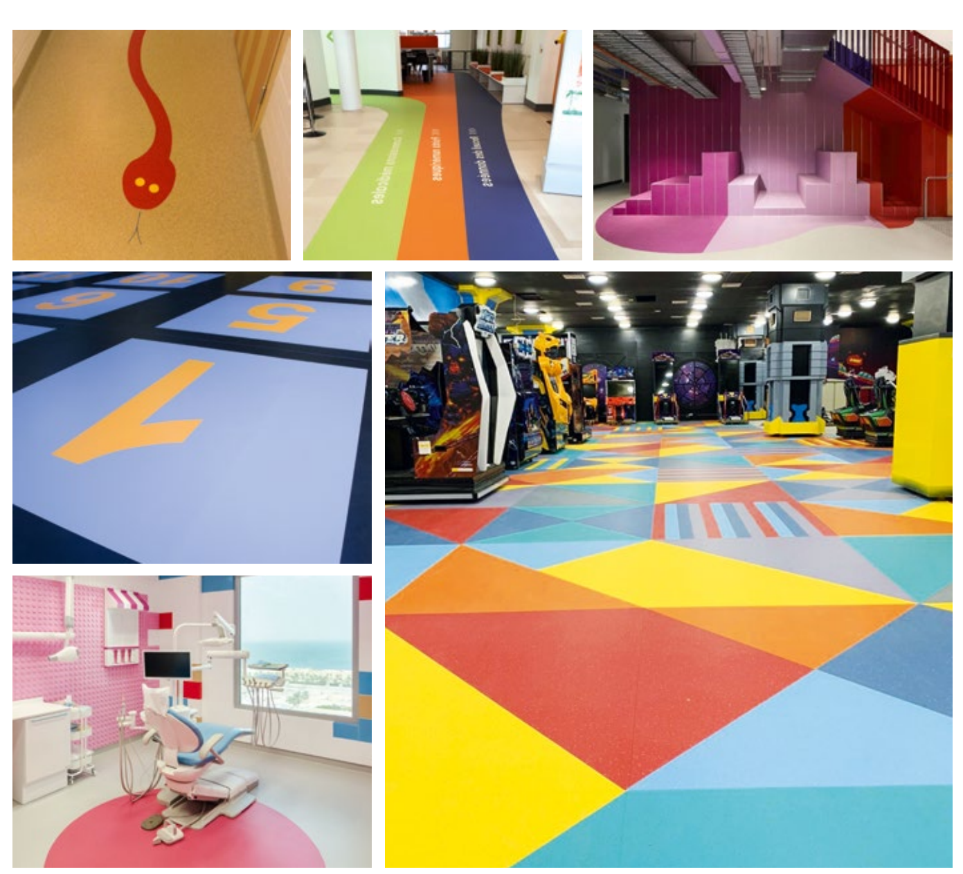
PLANKS AND TILES

the cutting will be inside the tile/plank